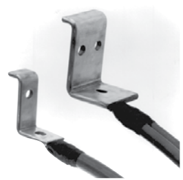
Double-sized neutral conductor handles excessive neutral currents